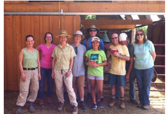
Tired but happy volunteers!!